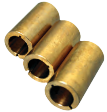
RR Bore Reducers