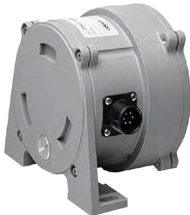
IT 9000 Series