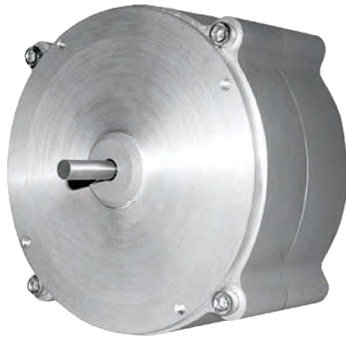
RT 9000 Series