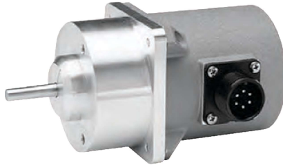
RT 8000 Series