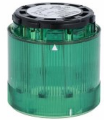
Signal tower Ø70mm/2.75" 8TL7GL - Light modules