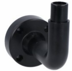
Fixing bases for signal tower and beacons - Vertical wall mount 8LT7BP02