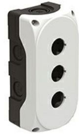
Plastic control station without actuators - for 3 actuators LPZP3A8