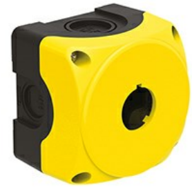
Plastic control station without actuators - for 1 actuators LPZP1A5