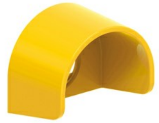
Shroud for buttons LPC B63..., LPC B66/67/68/BL666... LPXAU159