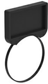
Label holder for engraved plastic LPX AU108 label LPXAU105