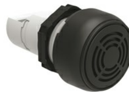
Monoblock buzzer - Continuous or pulse tone LPCZS