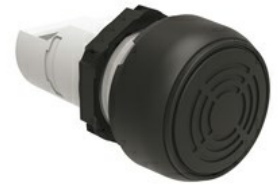
Monoblock buzzer - Continuous or pulse tone LPCZS