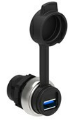
USB interface, A/B female type connection LPCD0