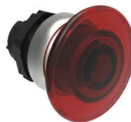
Illuminated mushroom head button actuators - Spring return Ø 40mm/1.6" LPCBL61