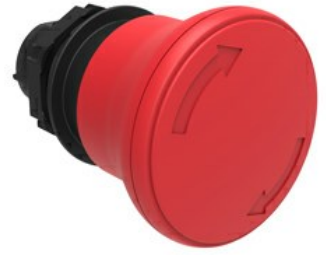
Mushroom head pushbutton, Latch, turn to release Ø 40mm/1.6" LPCB634