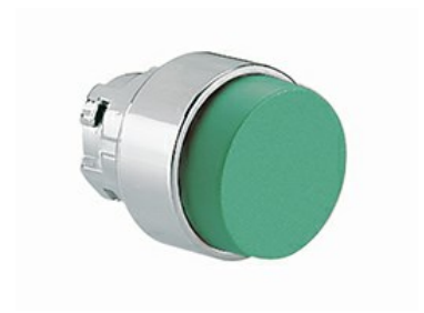
Push-push button actuators - Extended 8LM2TQ203