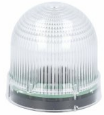
Signal beacons Ø62mm/2.44" 8LB6GL