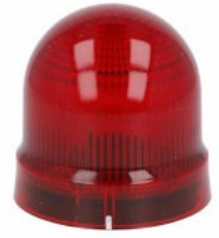
Signal beacons Ø62mm/2.44" 8LB6GL