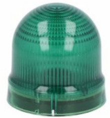
Signal beacons Ø62mm/2.44" 8LB6GL