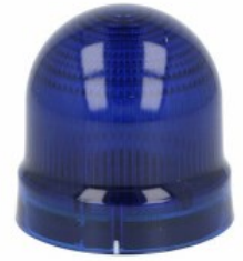
Signal beacons Ø62mm/2.44" 8LB6EL