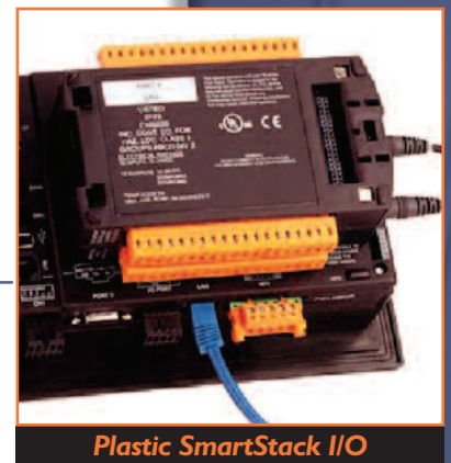
Plastic SmartStack I/O