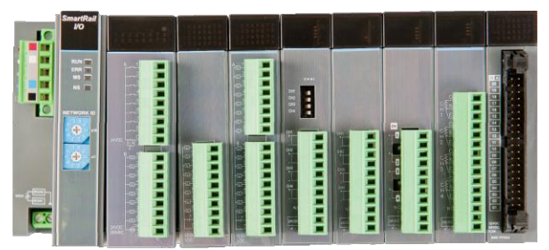
HE599COS100, with 8 I/O modules installed.

Modules can be added either before or after the CNX100 base has been installed on the DIN-rail.