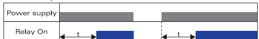
T10 On Delay