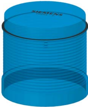
Single-flash light element, w. built-in electronic flash, blue, 230 V AC, Diameter 70 mm