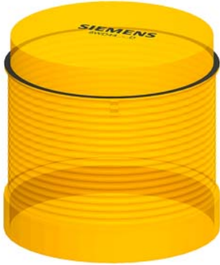
Flashlight element, with integrated LED, yellow, 115 V AC, Diameter 70 mm