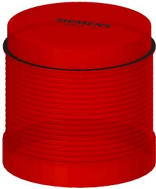
Single-flash light element, w. built-in electronic flash, red, 115 V AC, Diameter 70 mm