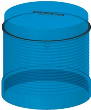
Continuous light element, with integrated LED, blue, 24 V AC/DC, Diameter 70 mm