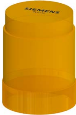
Flashlight element, with integrated LED, yellow, 115 V AC, Diameter 50 mm