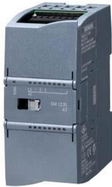
SIMATIC S7-1200, Analog input, SM 1231 TC, 4 AI thermocouples