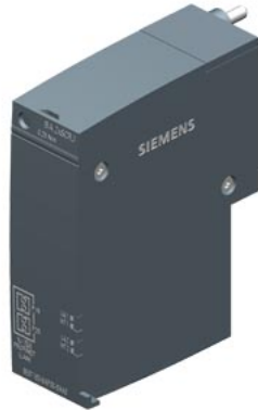
SIMATIC ET 200SP, BusAdapter BA 2xSCRJ, 2 SCRJ FO connections