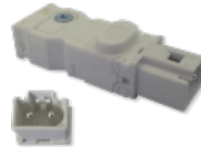
Wieland male connector part. no. 400703