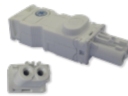
Wieland female connector part. no. 400702