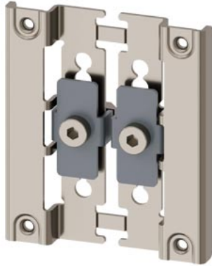
Strut section mounting adapter for enclosure, metal, sand gray