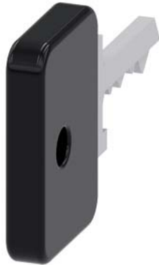
Key for key-operated switch O.M.R., lock number 73034, black