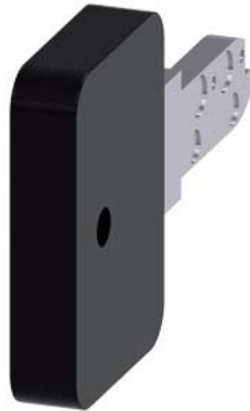
key for key-operated switch Siemens, lock no. VL5