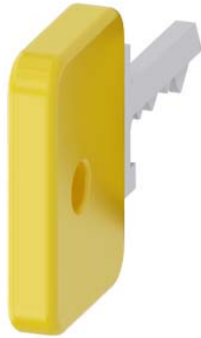
Key for key-operated switch O.M.R., lock number 73033, yellow