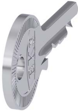
Key for key-operated switch BKS, Lock No. S1