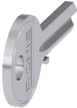
Key for RONIS key-operated switch, Lock No. SB30