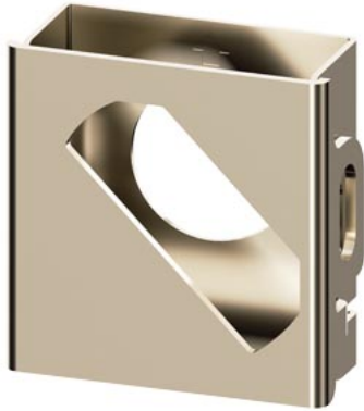
Locking device made of metal, for selector switch, 22 mm, short or long handle, in position left