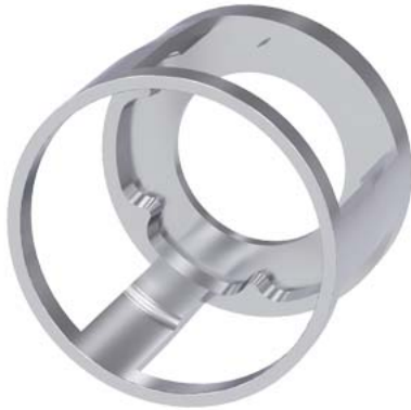
Protective collar for mushroom pushbutton, 40 mm, 22 mm design, 360° metal Viewable from the side