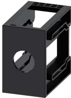
Adapter for DIN rail mounting Black, for command devices, 22 mm, round