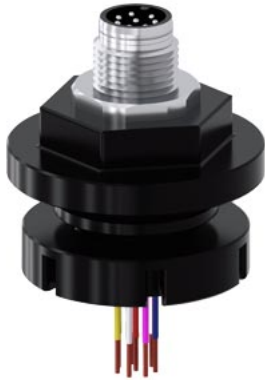
adapter M12 plug, 8-pole, for M20/M25 cable entry, for plastic/metal enclosure