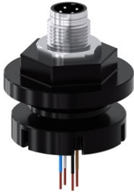
adapter M12 plug, 4-pole, for M20/M25 cable entry, for plastic/metal enclosure