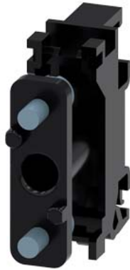
Enclosure cover monitoring, module with extension plunger