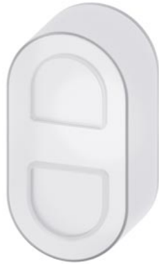
Silicone-free protective cover for Twin pushbutton, raised clear