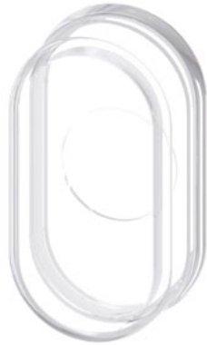
Silicone protection cap for Twin pushbutton, flat, clear