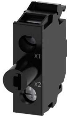
LED module with integrated LED 110 V AC, red, screw terminal, for floor mounting