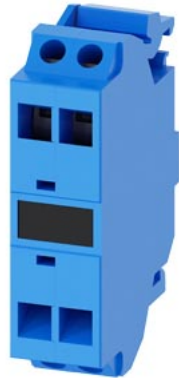
Support terminal, blue, spring-type terminal, for floor mounting