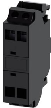
Support terminal, black, spring-type terminal, for floor mounting