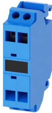
Support terminal, blue, spring-type terminal, for front plate mounting