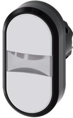
Twin pushbutton, 22 mm, round, plastic, white, white, pushbuttons, flat