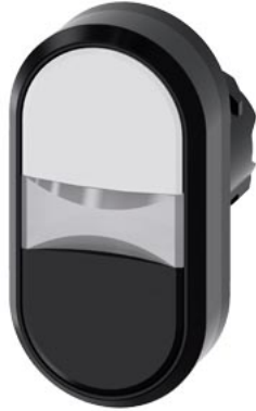
Twin pushbutton, 22 mm, round, plastic, white, black, pushbuttons, flat