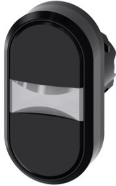
Twin pushbutton, 22 mm, round, plastic, black, black, pushbuttons, flat